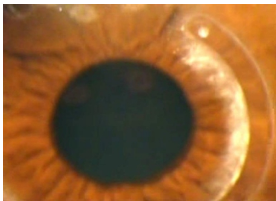
Figure 3 Crystalline deposits around the Keraring.

The analysis of our large number of case series (623 eyes) of ICRS (Kerarings) implantation using FS laser allowed encountering diverse number of complications and setting a protocol for dealing with each type, which improved our results over a period of 4 years. Most complications can be abolished if wise decision and meticulous manipulation were put into action. Yet, there are some complications that